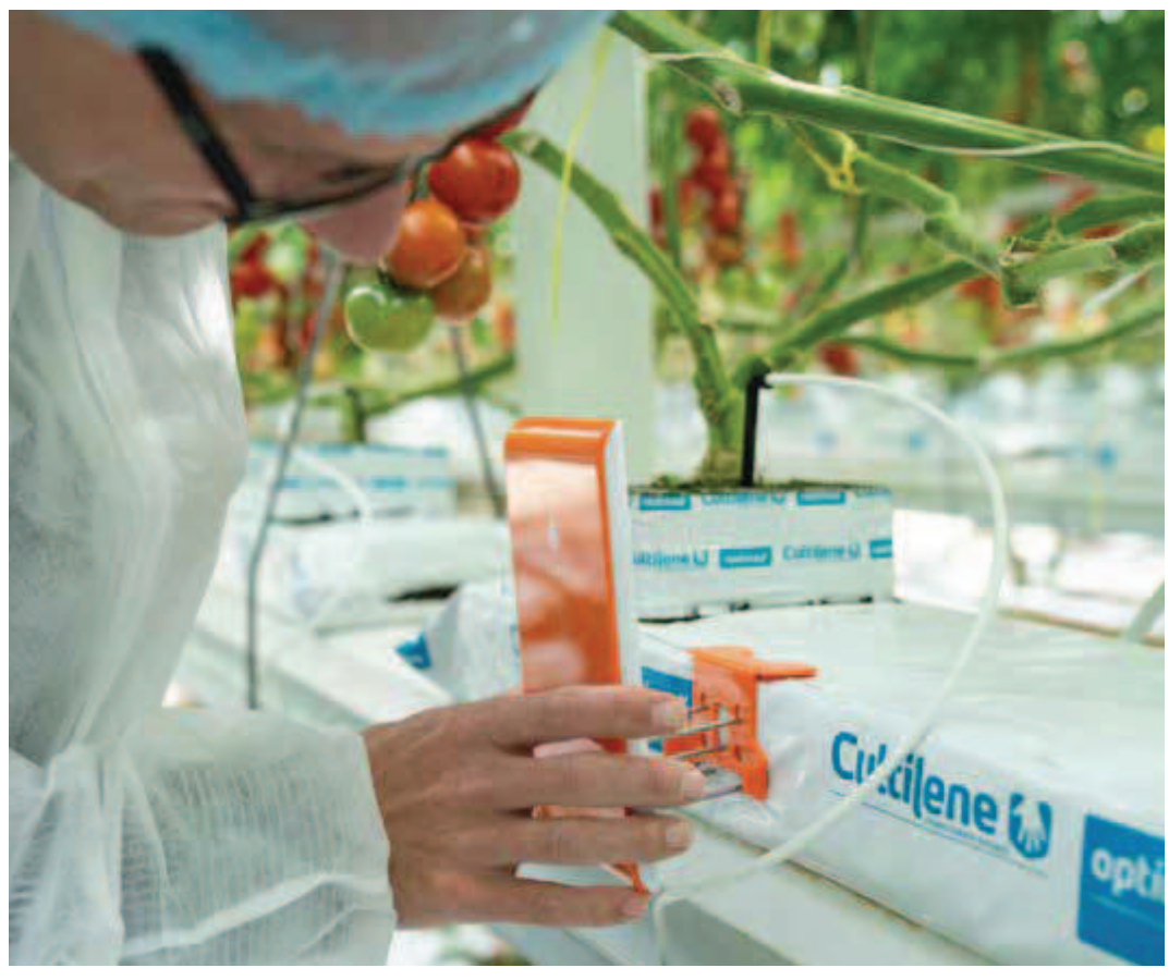
Each sensor has five pins which are inserted horizontally into the slab.

Unlike last year, the crop has not suffered from stress at all, which costs energy and